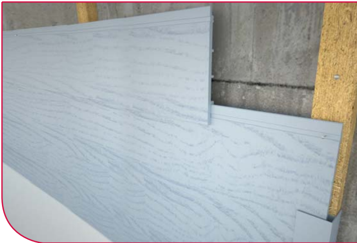
3. Installation of Weatherboard cladding.