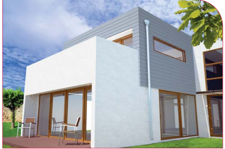
2. Installation suggestion for Weatherboard cladding.