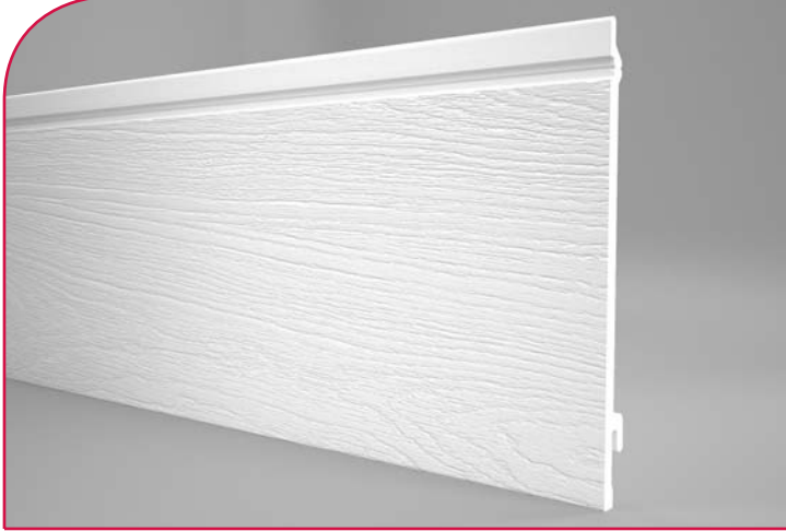
1. Weatherboard cladding board.