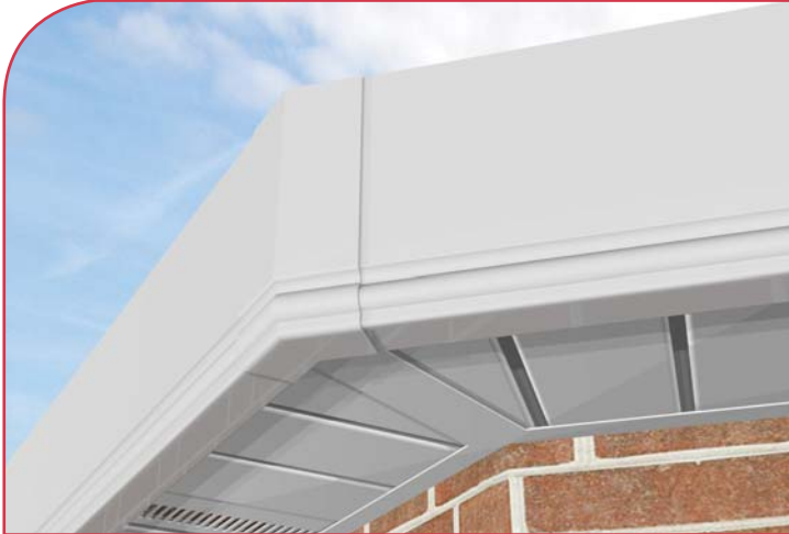
Introducing the new 135° External Corner Joiner from Freefoam