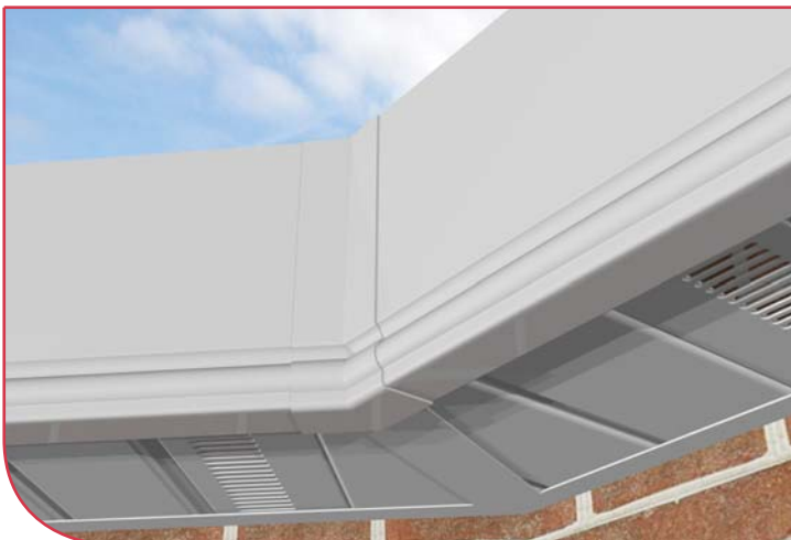
Introducing the new 135° Internal Corner Joiner from Freefoam