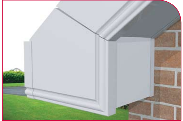
2. Common problem associated with imperfect cuts resulting in gaps