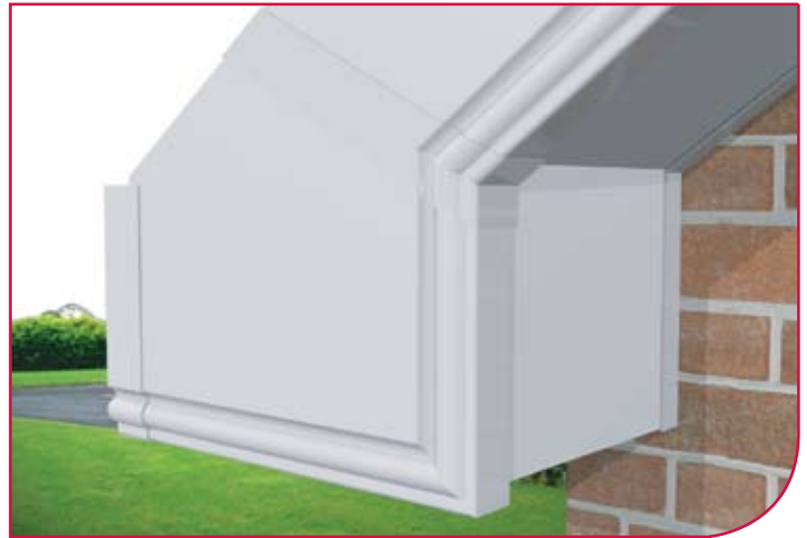
4. The Freefoam solution: Fast, simple, and tolerant of human error

1. The 125° Ogee Box Angle Joiner from Freefoam is the latest in a line of innovative solutions for the roofline installer. The product can be utilised to conceal unwanted gaps and imperfect joins on the gable box.